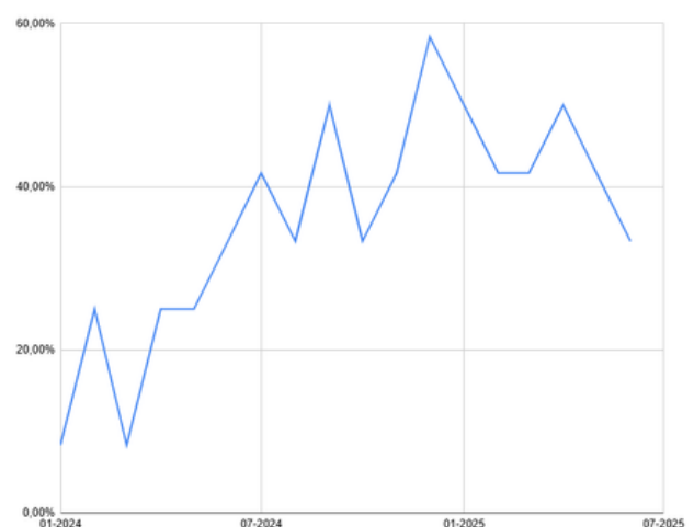
Recession odds chart

We continue to monitor liquidity, fiscal developments, and global currency trends to ensure our allocations remain both opportunistic and risk-aware.