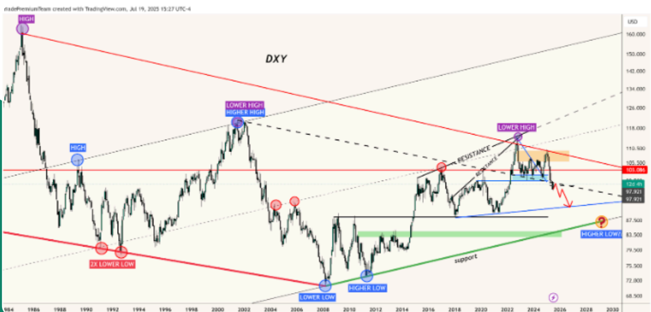
DXY Monthly Timeframe Analysis