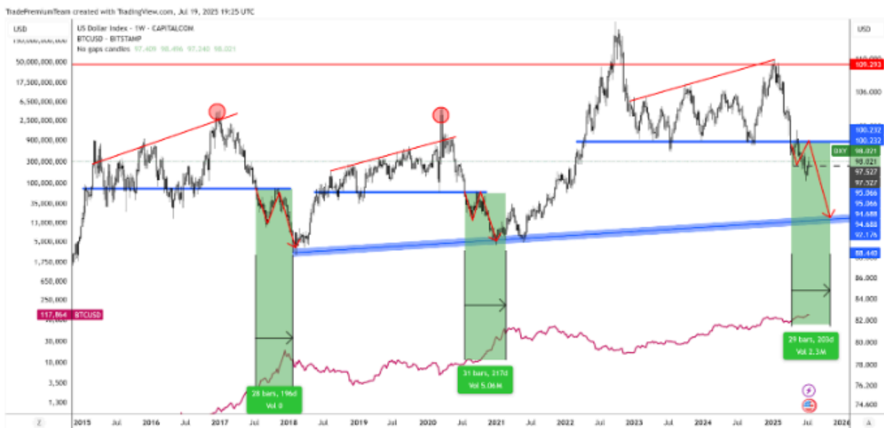
BTC (red chart) VS DXY Candlestick Chart

This was true in 2020, again in the summer of 2024, and remains relevant today. Since early July, the world has been clearly net short on the USD, an indication that investors are losing confidence in fiat and seeking alternatives. The result: an explosive $20,000 rally in just two weeks. Technically, this was the strongest breakout in months, but fundamentally, it is evidence of structural currency debasement combined with risk-on flows in an era where bonds and cash are losing their appeal.