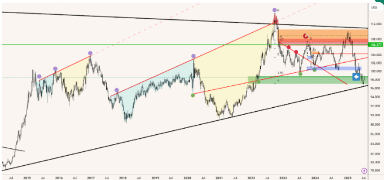
DXV Weekly Timeframe Analysis